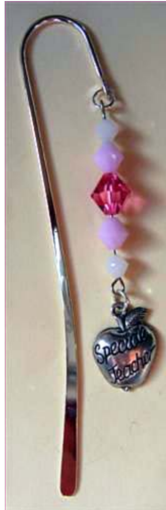
A FINISHED BOOKMARK

*ALL BEADSTYLE MAGAZINES HAVE A "BASIC TECHNIQUES" SECTION TOWARDS THE BACK OF THE MAGAZINE THAT DEMONSTRATES WITH PICTURES, AS WELL AS INSTRUCTIONS, HOW TO MAKE LOOPS IN HEADPINS AND OPEN JUMP RINGS. WE SHOULD HAVE SOME BEADSTYLE MAGAZINES IN OUR LIBRARY IF YOU DON'T WISH TO BUY ONE.